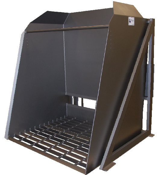
Extended pivot dumper shown with optional grated floor and debris slot.

See back page for additional options and specifications.