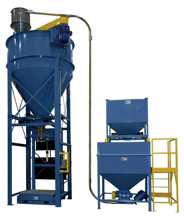
Pneumatic fill station w/ RAL, mixer, vacuum pump, receiver and automated bulk bag filler

What ever your process requirements, we look forward to providing a smart solution for you!