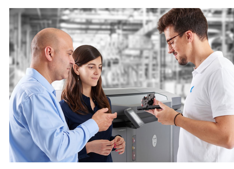
Learn more at hp.com/go/3DSupport

Accelerate your transformation with HP 3D Printing Grow Services , designed to help you grow, move into new materials, applications, and use cases, and further optimize your manufacturing processes.