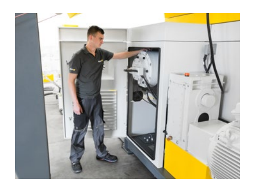
SHREDDER SHAFT The shredder shaft with its cooling water supply is protected behind a maintenance flap.

This enables easy control of the cooling water flow, for example.