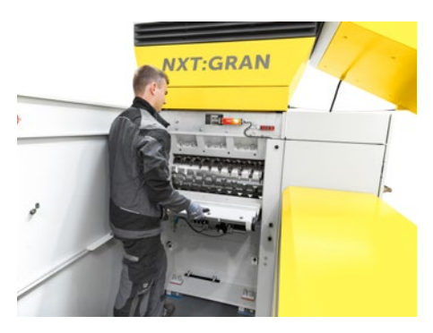
SHREDDER KNIVES The entire shredder cylinder with the shredder knives is freely accessible for maintenance work.

The entire feeding hopper features a slide-adjustment giving open-access to the cutting area. By avoiding the confined space, this is a significant contribution to worker safety.