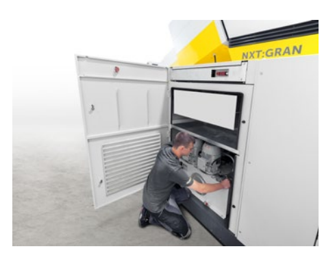
FREELY ACCESSIBLE SLIDE HYDRAULICS

The entire rear panel of the system can be opened, making all components of the slide hydraulics freely accessible.