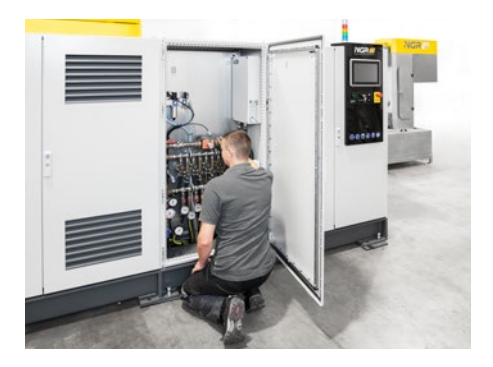
CENTRAL MEDIA CABINET All fittings are arranged in the media cabinet in an easy-to-read manner.

The extruder cover can be opened easily using a swiveling mechanism. This gives safe and maintenancefriendly access to extruder barrel and band heaters.